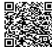
APP Android download