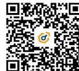
APP Android download