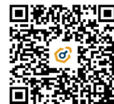
APP Android download